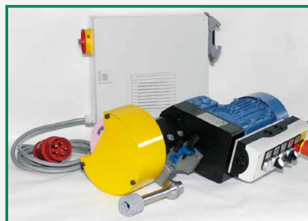
Cylindrical grinding device with switchbox, control panel and HSK-C40 grinding wheel mounting