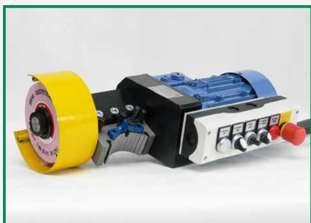
Cylindrical grinding device with control panel and HSK-C40 mounting for external grinding wheels